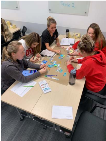
Learning activity - Jigsaw

By taking part of different courses with different teachers, I got a valuable experience of different kind of pedagogical tools, both in class and online courses. I also took part in several ODEE events: