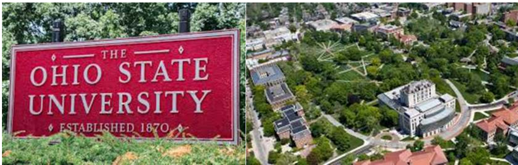
The Ohio State University and Campus

The Ohio state University 1 (OSU) is an old and enriched university established by Legislature in 1870. The main campus is located in Columbus but also include four regional campuses outside the city. In total, OSU has 61, 170 (Columbus campus, 2019) students which 46, 820 are undergraduates and 11, 097 graduate students. By residency, most of the students are Ohioans (42, 058) and 6, 731 are foreign students. At OSU you can study almost all areas, there are 15 colleges, more than 200 undergraduate majors, 168 master's degree programs, 114 doctoral degree programs, 9 professional degree programs and the estimated number of courses is today 12,000. In total, there are nearly 39,000 employees (autumn 2018). Based on the enrolments, OSU is the third largest public US Universities. OSU is tied for No. 54 among National Universities in the 2020 Best Colleges rankings. OSU is known for its academic rigor as well as for its Ohio State Buckeyes, its sports program, which is a member of the Big Ten athletic conference. You can't miss the American football College team The Buckeyes!