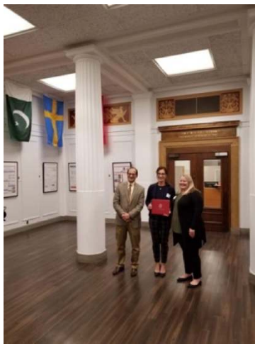
Research exposition, OSU

The teachers at the Dental hygiene Division, are a young academic team but with a high interest in research progression. During my time at the College of Dentistry, I have had individual meetings both with dental hygiene teachers and dental researchers to discuss possible projects and ways of cooperation's. Also, my PhD students from Sweden, had an online lecture about their research area (sleep apnea) in one course. This