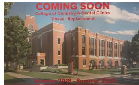
College of Dentistry, the new building 2020.

Division of Dental Hygiene 3 is the only dental school-based dental hygiene program in Ohio. The Division of Dental Hygiene (DHD) is one of the nine academic divisions at the College of Dentistry. It is a 2+2 year program and includes a baccalaureate degree. Each year there are 32 new dental hygienist students. The program will be presented and discussed below and in comparison, with the Swedish program.