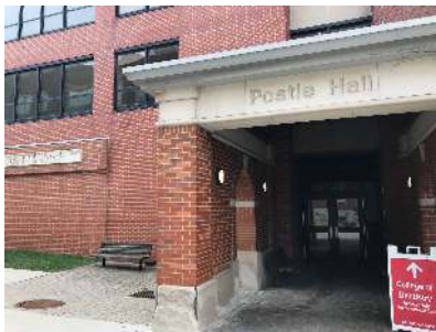
Postal Hall, College of Dentistry, old building.

Their new campaign “ Building on Strong Foundations campaign ” is about the future. The Postal Hall , is the name of the building where the College of Dentistry has been placed for more than 125 years. Now, a new modern building will replace to expand the position as a national leader in dental education, research, and patient care. This will be ready in summer 2020.