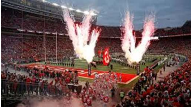
Ohio State Buckeyes