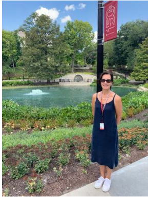
Lake Mirrow on Campus, OSU.

There are a lot of similarities but also differences between The Dental hygiene program at OSU and my home institution in Sweden. However, the Dental hygienist program at OSU in Ohio state, also differ from other states in US, which is an important fact to observe. There are no national guidelines, but each state has their own Dental practice Act, performed by the State Dental board. Thus, there are differences also within US regarding the contents within the education and rules for practice. For Sweden, Dental care and the dental