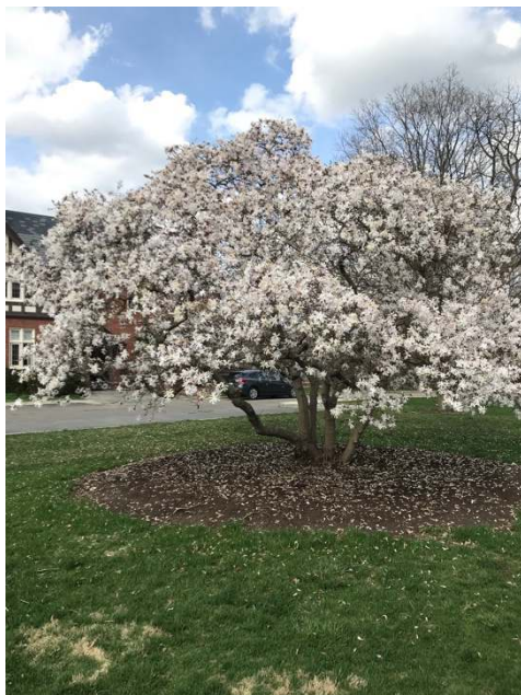
Magnolia tree on Campus

After the planning trip, all the practical things with VISA and J1/J2 applications started, which was a lot. However, the International Scholar Immigration coordinator at the Office of International Affairs and the Human Recourses at OSU/ College of Dentistry was very supportive during this process. Later, I also got information about preparations for insurance and health care. According to the College of Dentistry Protocol I needed obtain/provide proof of Immunizations. To prepare my tasks for the fall, I also asked for the fall 2019 syllabus, which was sent to me my by e-mail. That gave me a good overview of the different subjects where I could co-teaching and observe. In the beginning of August, we left Sweden and after some days, I started my fall semester at the Dental Hygiene Division at OSU.